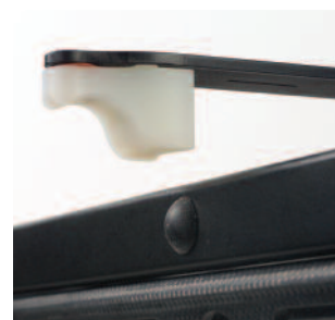
Prodigy Lok-Bar Patent Pending