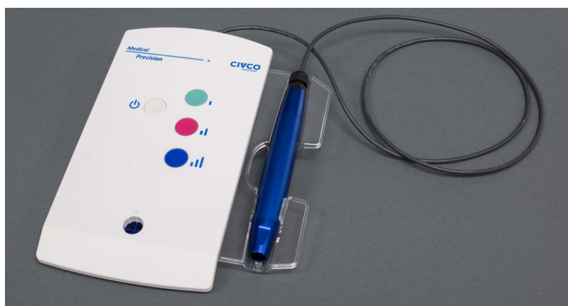
Control Unit and Pen